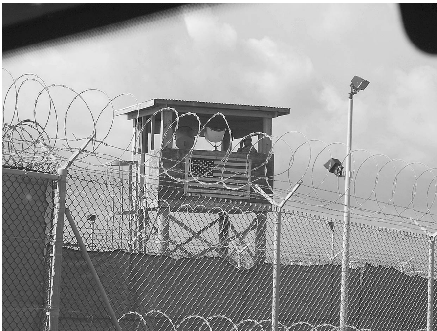
One of the Guard Towers at Guantanamo

to delete the photo that evening. It worked: she did not advise him, and he did not delete it.