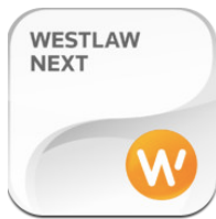
http://bit.ly/11hK0sb Westlaw Next