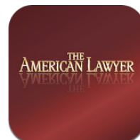
http://bit.ly/ZEoZ8m The American Lawyer