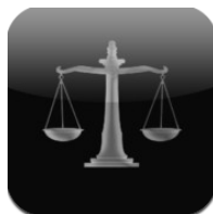
http://bit.ly/15mZYH1 Rulebook The Bluebook App