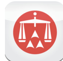
http://bit.ly/11sAXDn American Arbitration Association