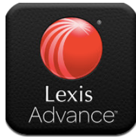
http://bit.ly/11ZCSFL Lexis Advance