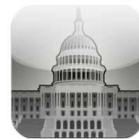
http://bit.ly/T11YvX Congressional Record