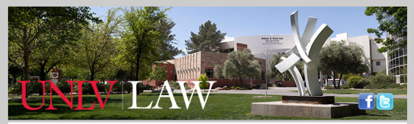
Boyd Briefs: March 6, 2014