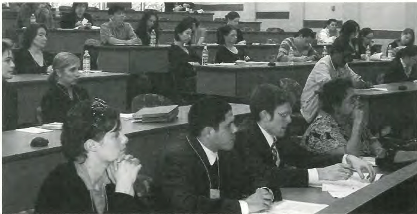
Grillo Retreat attendees