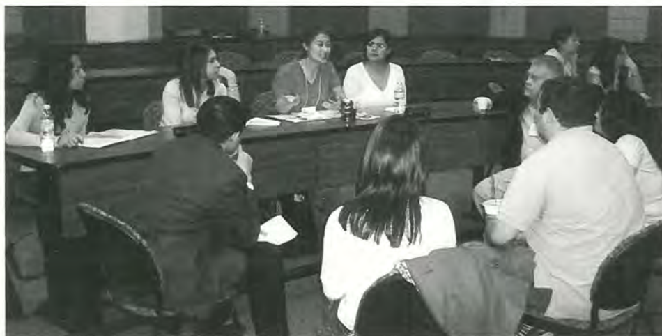
Participants brainstorm about nonprofit law practice