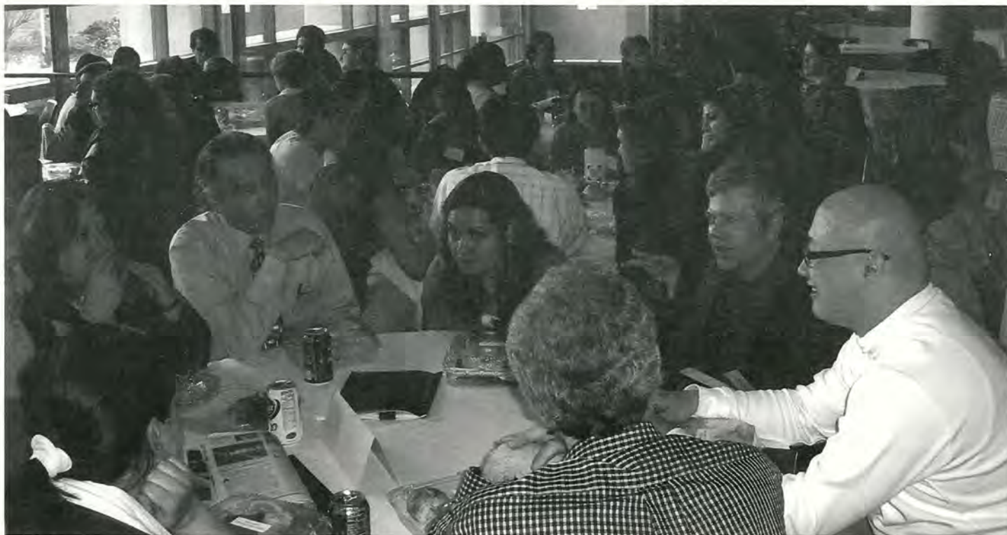
Grillo Retreat participants at lunch