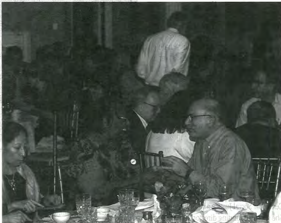
Diners at the 2007 Annual Awards Dinner

One time each year, SALT members and their friends get together to visit with old friends from law schools around the country and to meet new ones, share a meal and honor those most representative of SALT's ideals of social justice. As usual, the 2007 dinner was scheduled in conjunction with the AALS annual meeting, which was in Washington, D.C. Almost 200 people