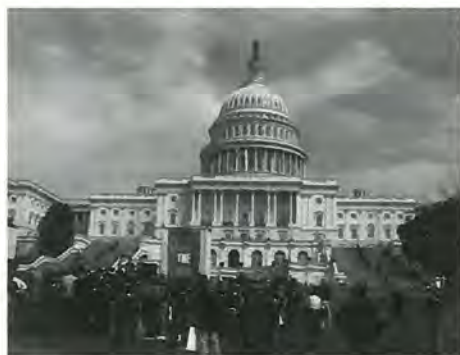
Lobby Day participants

Next year's Lobby Day will take place March 6-7, 2008, in Washington, D.C. Plan to join us!