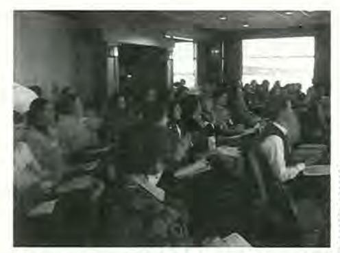
Grillo Retreat participants

Because money makes the world go around but – unfortunately – it doesn't grow on