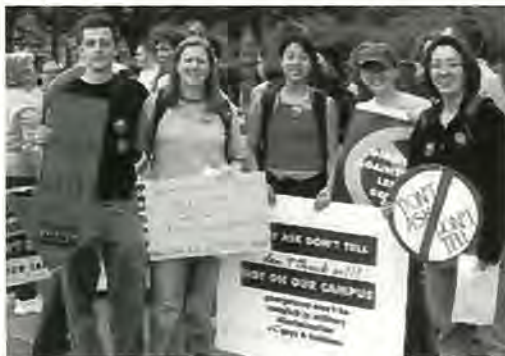
Solomon Amendment protesters

By the time you read this article, the Supreme Court of the United States will have heard the arguments in FAIR v. Rumsfeld , scheduled for Tuesday, December 6 (before the publication of this edition of the Equalizer , but after the writing of this update). Arguing for FAIR, SALT, and their