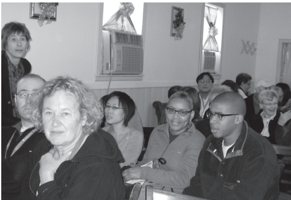
Day of Service participants