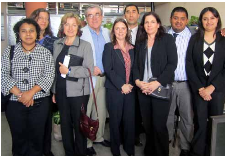
U.S. delegation of law professors and activists meet with Guatemalan prosecutors

Human Rights Committee, continued on page 11