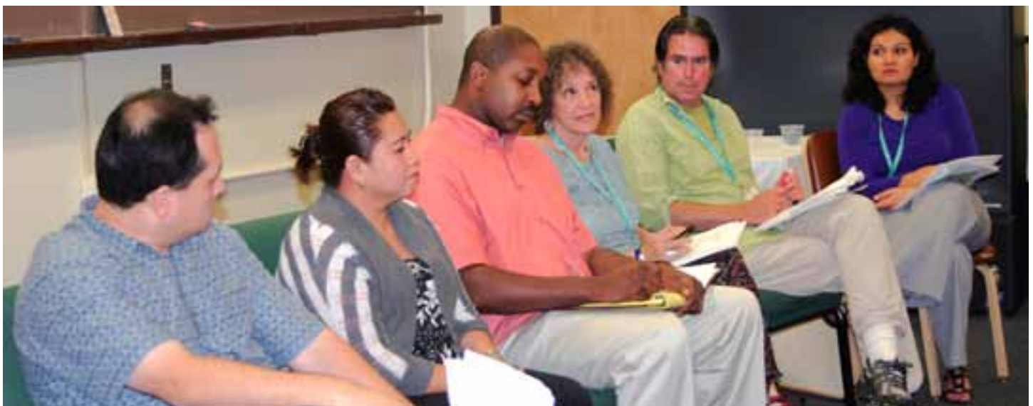
Labor teach-in at Hawai'i