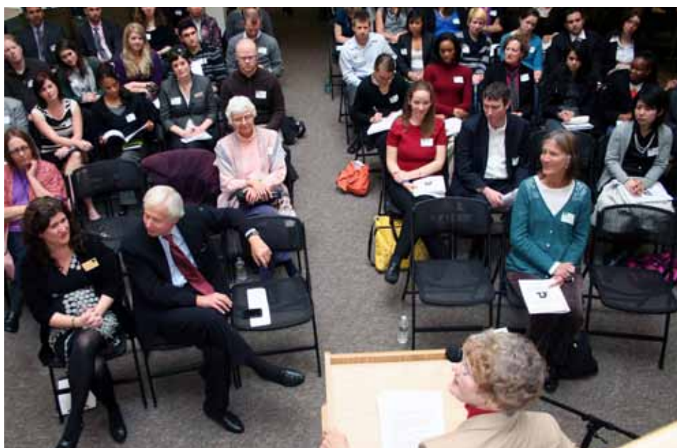
Opening keynote at the Grillo Retreat