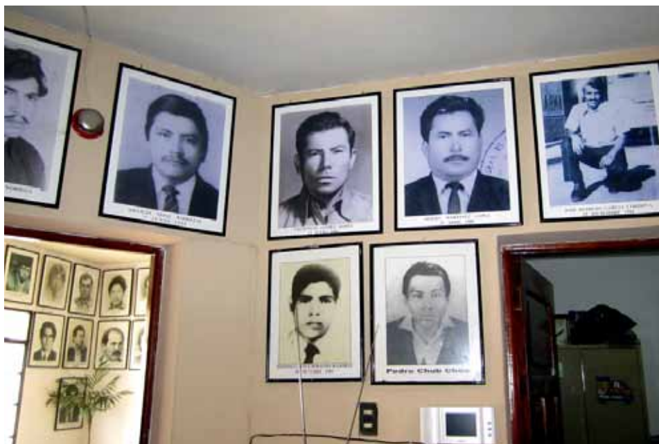
Photos of the disappeared on the walls of the FAMDEGUA office