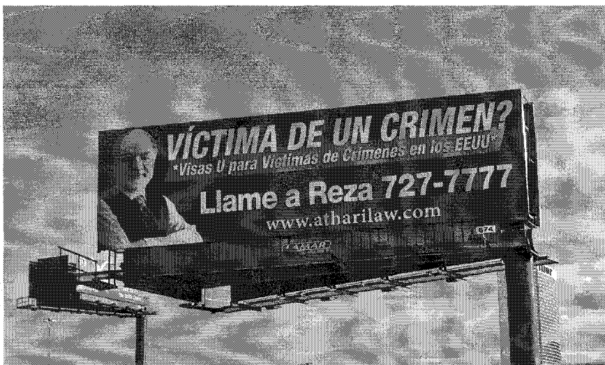
FIGURE 1: ATTORNEY BILLBOARD IN LAS VEGAS, NV, IN 2014, ADVERTISING “U VISAS FOR VICTIMS OF CRIME IN THE USA.”